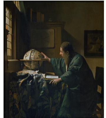
Fig 3. Johannes Vermeer, The Astronomer , ca. 1668, oil on canvas, 51 cm x 45 cm, Musée du Louvre, Paris, inv. no. R.F. 1983-28