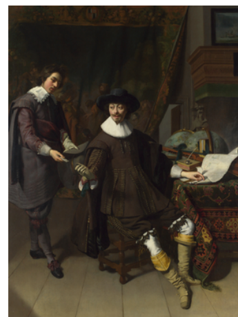
Fig 2. Thomas de Keyser, Constantijn Huygens and His Clerk , 1627, oil on panel, 92.4 cm x 69.3 cm, National Gallery, London, inv. no. NG21