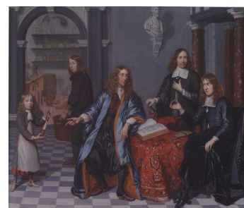
Fig 1. Cornelis de Man, Three Pharmacists , 1670s, oil on canvas, 90 × 112 cm, National Museum, Warsaw, inv. no. M.ob. 22

Cornelis de Man, who became a member of the Guild of Saint Luke of Delft in 1642, travelled to France and Italy before settling back in Delft around