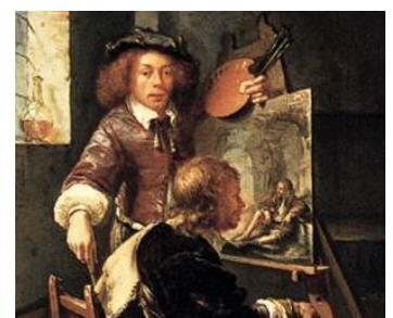
Fig 2. Detail of Frans van Mieris the Elder, The Painter in His Studio , ca. 1657, oil on panel, 63.9 x 46.8 cm, Staatliche Kunstsammlungen, Dresden, Gemäldegalerie Alte Meister, 1751