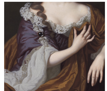
Fig 2. Detail of MM-102.b