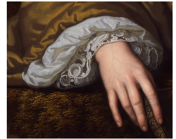
Fig 1. Detail of MM-102.a showing the delicate shadow of the sitter's proper right cuff on the lace

Old handwritten inscriptions on the reverses of the canvases identify the sitters as 26-year-old Pieter Ranst Valckenier (1661–1704) and his 17-year-old wife, Eva Suzanna Pellicorne (1670–1732) ( fig 3 ) and ( fig 4 ). [2]