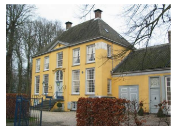
Fig 6. Valck en Heining mansion, Loenersloot (outside Amsterdam), built in 1677 by Cornelis Valckenier (1640–1700), second cousin of Pieter Ranst Valckenier