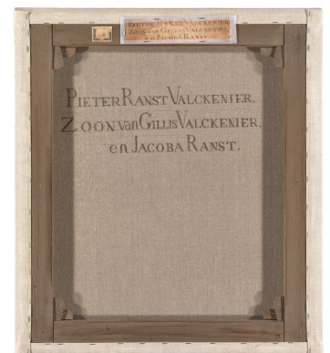
Fig 3. Reverse of MM-102.a revealing the inscription identifying the sitter. The original inscription on the old linen was reproduced in Mylar-encapsulated images and attached to the tops of the reverse, while the contents of the inscription was copied onto the relined canvas.