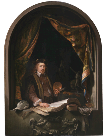
Fig 7. Gerrit Dou, Self-Portrait , ca. 1665, oil on panel, arched top, 59 x 43.5 cm, Rose-Marie and Eijk van Otterloo Collection, Boston

Rijksmuseum, Amsterdam, inv. no. SK-A-4232