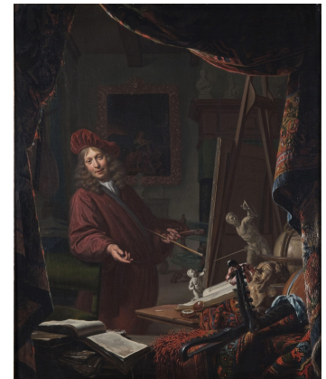
Fig 5. Michiel van Musscher, Self-Portrait , 1679 oil on panel, 56 x 46.5 cm, Het Schielandshuis, Rotterdam, inv. no. HMR 10567