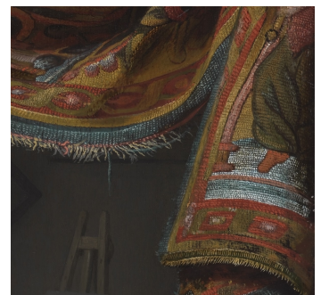
Fig 2. Detail of Michiel van Musscher, Portrait of the Artist in His Studio , MM-103, showing the tapestry