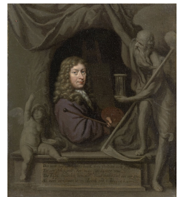
Fig 6. Michiel van Musscher, Self-Portrait , 1685, oil on canvas, 20.5 x 17.8 cm,