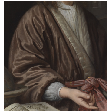
Fig 1. Detail of Michiel van Musscher, Portrait of the Artist in His Studio , MM-103, showing the right sleeve of the silk rok

This early painting by Van Musscher is executed with an astounding level of detail, and foreshadows the artist's interest in depicting different fabrics, which would come to full development in his late career. Van Musscher achieved the glistening quality of the satin rok , possibly the actual "paerse sautijne Japone Rock" listed in Van Musscher's posthumous 1705 inventory, [2] by applying highlights along the folds of the garment with a thick brush ( fig 1 ), and by offsetting the rok against the finely painted bare floorboards behind him. He also achieved a remarkable realism in the tapestry, especially in the extraordinary detail of the slightly frayed edges, by alternating short, opaque brushstrokes with tiny dots to simulate the weave pattern ( fig 2 ). The care Van Musscher took to depict his objects down to the most minute details is particularly evident in the open book, which has been identified as two pages from the 1555 Dutch edition of Sebastiano Serlio's (1475–1554) famous treatise Tutte l'opere d'architettura et prospetiva . These pages explain how to draw an