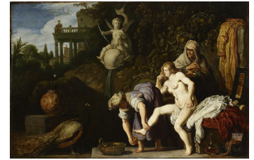
Fig 4. Pieter Lastman, The Bathing of Bathsheba , 1619, oil on panel, 42 x 63, The State Hermitage Museum, St. Petersburg, 5590

This exquisitely preserved painting is one of Lastman's finest works, not only in the characterization of the figures but also in the way the structural clarity of the composition reinforces the dramatic thrust and power of this