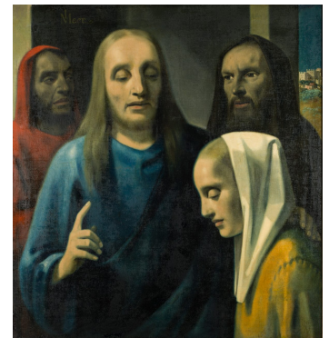
Fig 5. Han van Meegeren (forgery as a work by Johannes Vermeer), Christ and the Woman Taken in Adultery , ca. 1942, oil on canvas and mixed media, 100 x 90 cm, Collection Museum de Fundatie, Zwolle and Heino/Wijhe, the Netherlands, Loan from Cultural Heritage Agency of the Netherlands