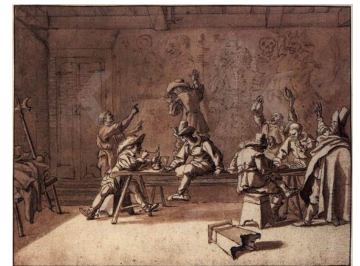
Fig 2. Pieter van Laer, The Bentveughels in a Roman Tavern , ca. 1630, brown ink and wash on paper, 20.3 x 25.8 cm, Kupferstichkabinet, Staatliche Museen zu Berlin, inv. 5239