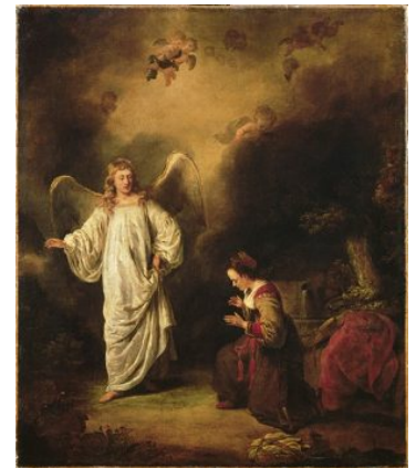
Fig 3. Ferdinand Bol, Hagar and the Angel , ca. 1650, oil on canvas, 115.6 x 97.8 cm, Museum Pomorskie, Gdansk