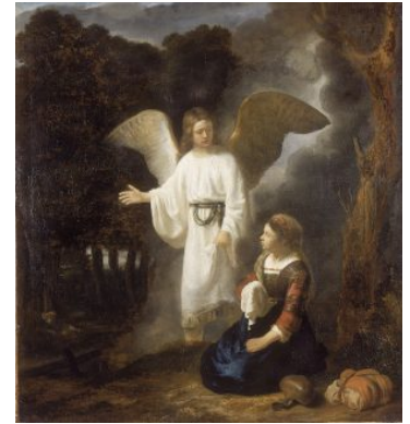
Fig 2. School of Rembrandt, The Angel Appearing to Hagar , ca. 1658–59, oil on canvas, 109.5 x 100.5 cm, Walker Art Gallery, Liverpool

For the majestic figure of the angel, Fabritius exploited the full range of his painterly techniques to achieve expressive effects. Rays of heavenly light surround the angel’s head in concentric bands of colors, while semitransparent streams of light emanate from his form, as though he were passing through the haze of heavy mist. His confident yet intuitive brushwork