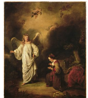
Fig 3. Ferdinand Bol, Hagar and the Angel , ca. 1650, oil on canvas, 115.6 x 100.5 cm, The Leiden Collection