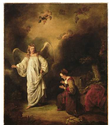
Fig 3. Ferdinand Bol, Hagar and the Angel , 1658, oil on canvas, 109.5 x 100.5 cm, The Leiden Collection