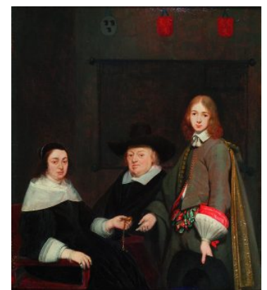
Fig 1. Gerard ter Borch, Portrait of Charles de Liedekercke, His Wife, Willemina van Braeckel, and Their Son Samuel (1638–d. before 1655), ca.

The portraits of the Craeyvanger family of Arnhem were practically unknown when they appeared at a sale in Amsterdam in May 2009. [1] The 10 portraits caused an immediate stir, not only because it is unusual for such a group to survive, but also because of their exceptionally high quality, particularly the likenesses of the four oldest children by Gerard ter Borch (1617–1681). The series of eight children’s portraits were offered for sale in two separate lots, the four oldest children as autograph works by Ter Borch, the four youngest as by “Gerard ter Borch and studio.” [2] The portraits of the four oldest children betray the hand of a more experienced master, evident in the more subtle execution of the faces, hands, and