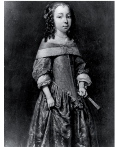
Fig 2. Attributed to Caspar Netscher, Portrait of Wilhelmina Everwijn (1649–1737), ca. 1658, oil on copper, 28 x 23 cm, present whereabouts unknown (art dealer A. Brod, London 1958)

The two oldest boys—Jan and Willem, 17 and 15 years old, respectively—are nearly grown up. [8] Both of these self-assured youths are shown resting a hand on a hip below a light gray cape and demonstratively holding a hat in the other hand. Their somewhat elongated faces are delicately characterized. These unsigned portraits display the refined, unerring style of painting and soft brushwork of Ter Borch, who—unlike Netscher—did not usually sign his work. The meticulous rendering of the boys' fashionable clothing was a specialism of Ter Borch and one that was highly valued by his clientele. [9] The gray doublets are unbuttoned at the bottom, allowing their white shirts to blouse out and exposing their tablier de galants , an apronlike skirt of ribbon loops. Like the four younger brothers, they wear flat collars, tied with tasseled band-strings. The use of subtle highlights—on their fingernails, for example—is also characteristic of Ter Borch. Such details lend his figures an almost