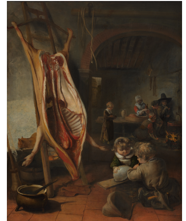
Fig 1. Barent Fabritius, Slaughtered Pig , 1665, oil on canvas, 101 x 79.5 cm, Museum Boijmans van Beuningen, Rotterdam, inv. 1214