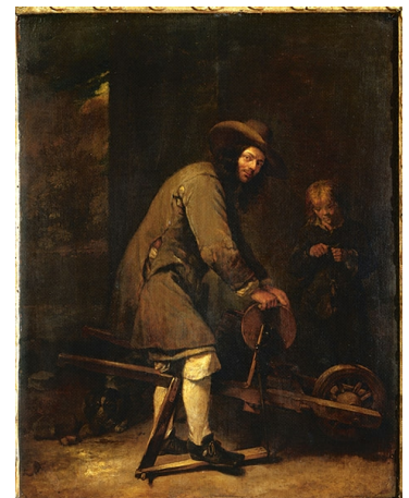
Fig 4. Caspar Netscher, The Knife Grinder , 1662, oil on panel, 43 x 34 cm, Galleria Sabauda, Turin, inv. 67, © 2015, photo Scala, Florence, courtesy of the Ministero Beni e Att. Culturali