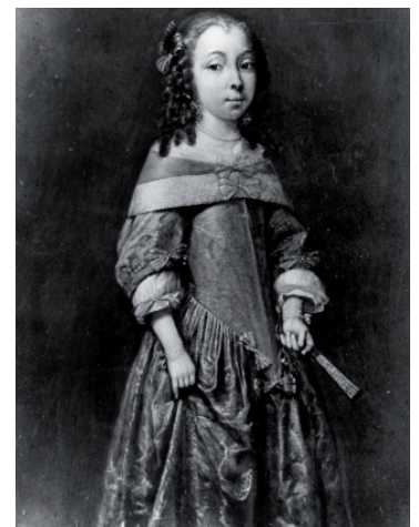
Fig 2. Attributed to Caspar Netscher, Portrait of Wilhelmina Everwijn (1649–1737), ca. 1658, oil on copper, 28 x 23 cm, present whereabouts unknown (art dealer A. Brod, London 1958)