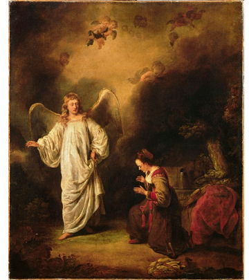
Fig 3. Ferdinand Bol, Hagar and the Angel , ca. 1650, oil on canvas, 115.6 x 97.8 cm, Museum Pomorskie, Gdansk

The story of Hagar was one of the most frequently portrayed Old