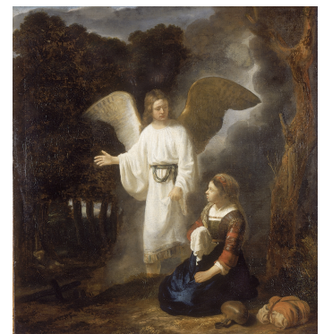
Fig 2. School of Rembrandt, The Angel Appearing to Hagar , ca. 1658–59, oil on canvas, 109.5 x 100.5 cm, Walker Art Gallery, Liverpool