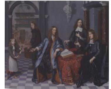
Fig 1. Cornelis de Man, Three Pharmacists , 1670s, oil on canvas, 90 × 112 cm, National Museum, Warsaw, inv. no. M.ob. 22