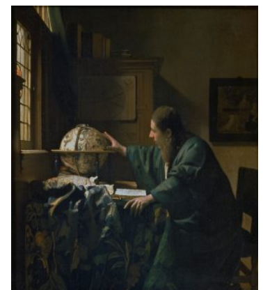
Fig 3. Johannes Vermeer, The Astronomer , ca. 1668, oil on canvas, 51 cm × 45 cm, Musée du Louvre, Paris, inv. no. R.F. 1983-28