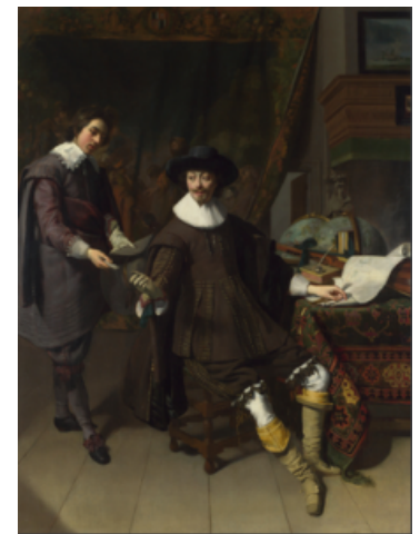
Fig 2. Thomas de Keyser, Constantijn Huygens and His Clerk , 1627, oil on panel, 92.4 cm x 69.3 cm, National Gallery, London, inv. no. NG21