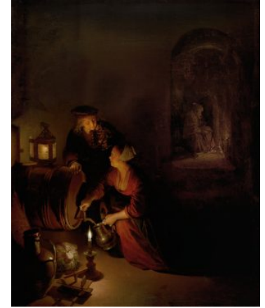
Fig 3. Gerrit Dou, Wine Cellar—An Allegory of Winter , ca. 1660, oil on panel, 30.5 x 25.4 cm, Hohenbuchau Collection, on permanent loan to Leichtenstein, The Princely Collections, Vienna