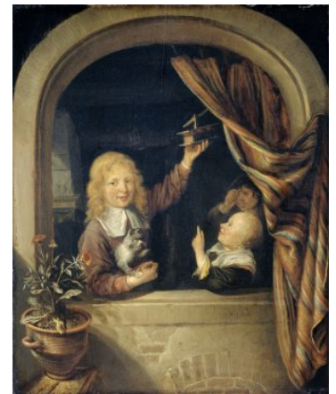
Fig 1. Dominicus van Tol, Children with a Mousetrap , oil on panel, 31 x 25 cm, Rijksmuseum, Amsterdam, inv. SK-A-417