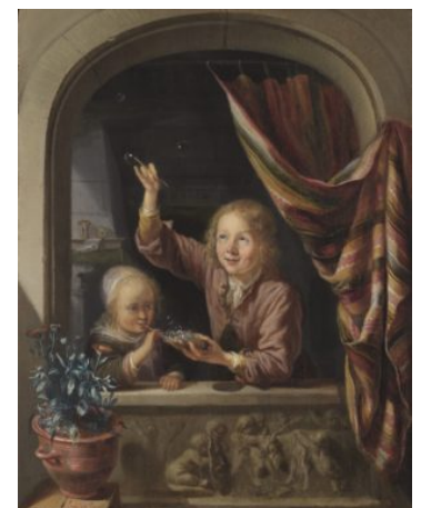
Fig 2. Dominicus van Tol, Children at a Window Blowing Bubbles , oil on panel, 31 x 25 cm, The Leiden Collection