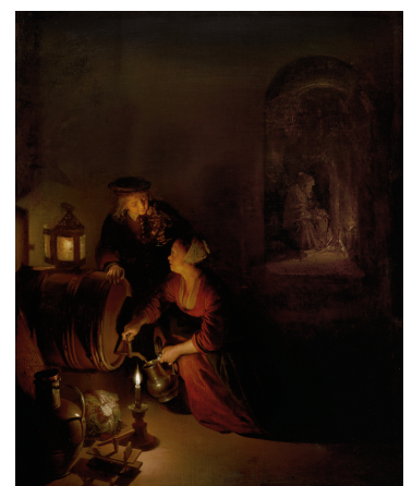
Fig 3. Gerrit Dou, Wine Cellar—An Allegory of Winter , ca. 1660, oil on panel, 30.5 x 25.4 cm, Hohenbuchau Collection, on