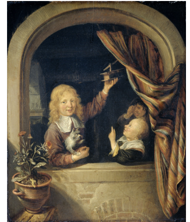
Fig 1. Dominicus van Tol, Children with a Mousetrap , oil on panel, 31 x 25 cm, Rijksmuseum, Amsterdam, inv. SK-A-417