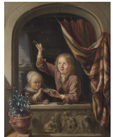
Fig 2. Dominicus van Tol, Children at a Window Blowing Bubbles , oil on panel, 27 x 21.6 cm, © The Leiden Collection, New York, DT-101