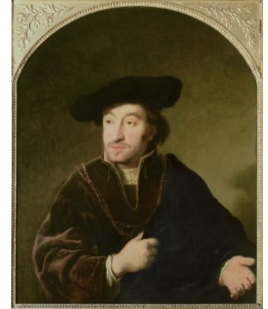
Fig 3. Ferdinand Bol, Portrait of a Gentleman , ca. 1645, oil on canvas, 86.4 x 70.5 cm, Private Collection

1640, oil on canvas, 102 x 80 cm, National Gallery, London, NG672