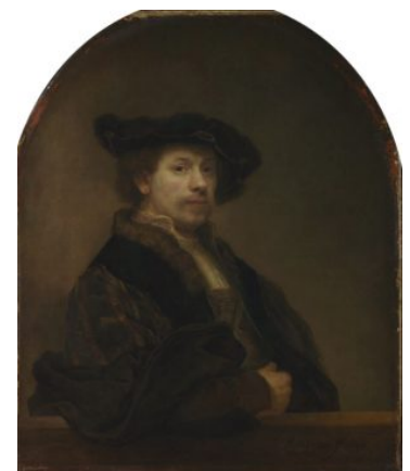
Fig 2. Rembrandt van Rijn, Self-Portrait at the Age of 34 ,