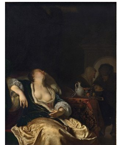
Fig 2. Frans van Mieris the Elder, A Sleeping Courtesan , 1669, oil on copper, 27.5 x 22.5 cm, Galleria degli Uffizi, Florence, inv. 1890, no. 1263