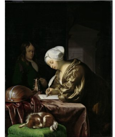
Fig 4. Frans van Mieris the Elder, The Letter Writer , 1680, oil on panel, 25 x 19.5 cm, Rijksmuseum, Amsterdam, SK-A-261