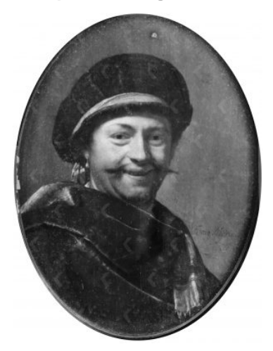
Fig 1. Frans van Mieris the Elder, Self-Portrait , 1661, oil on panel (oval), 11.2 x 8.4 cm, private collection