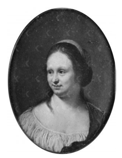
Fig 2. Frans van Mieris the Elder, Portrait of Cunera van der Cock, the Painter's Wife , 1662, oil on panel (oval), 11.2 x 8.4 cm, private collection

Van Mieris conceived this small painting as a tronie , a type of picture in which painters represented a character type or a particular facial expression, in this case, surprise. In traditional portraits, sitters were never depicted smiling.<sup>[9]</sup> Moreover, in his "official" self-portraits, Van Mieris always presented himself as a true gentleman, as can be inferred from a painting of 1667 (fig 3).<sup>[10]</sup> This type of small "pseudo" self-portrait was probably intended as a comic image, which at the same time constituted a fine example of Van Mieris's exquisite technique. That paintings of this kind were not interpreted as "ordinary" portraits is clear from descriptions in the inventory of the Leiden collector Franciscus de le Boë Sylvius (see FM-104). This document made a clear distinction between the portraits and tronies of Van Mieris in the collection, even though the painter and his wife were recognized in each.<sup>[11]</sup>