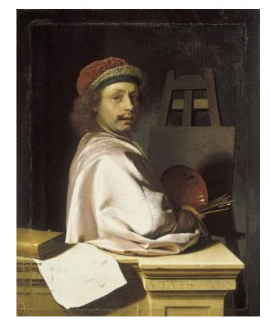
Fig 3. Frans van Mieris the Elder, Self-Portrait as a Painter , 1667, oil on panel, 17.7 x 13.3 cm, Polesden Lacey, Surrey, The National Trust