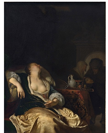
Fig 2. Frans van Mieris the Elder, A Sleeping Courtesan , 1669, oil on copper, 27.5 x 22.5 cm, Galleria degli Uffizi, Florence, inv. 1890, no. 1263, © 2015. Photo Scala, Florence, courtesy of the Ministero Beni e Att. Culturali