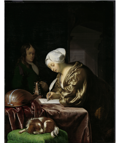
Fig 4. Frans van Mieris the Elder, The Letter Writer , 1680, oil on panel, 25 x 19.5 cm, Rijksmuseum, Amsterdam, SK-A-261

Doctor's Visit , 1667, oil on panel, 44.5 x 31.1 cm, The J. Paul Getty Museum, Los Angeles, inv. no. 86.PB.634