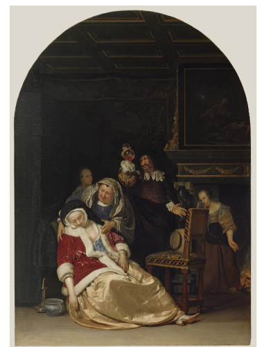
Fig 3. Frans van Mieris the Elder, © 2017 The Leiden Collection