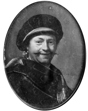
Fig 1. Frans van Mieris the Elder, Self-Portrait , 1661, oil on panel (oval), 11.2 x 8.4 cm, private collection