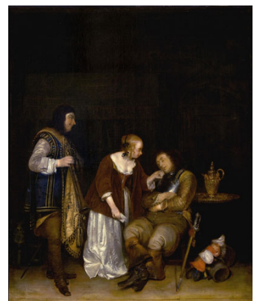
Fig 3. Gerard ter Borch, Sleeping Soldier , ca. 1656–57, oil on canvas, 63.5 x 55 cm, The Taft Museum, Cincinnati, inv. no. 1931.398