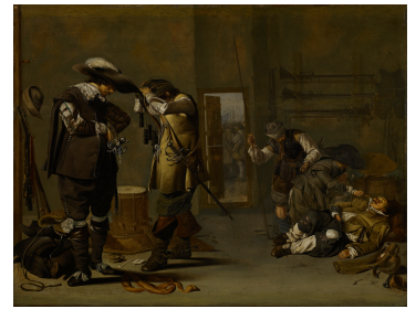
Fig 1. Jacob Duck, Soldiers Arming Themselves , mid-1630s, oil on panel, 43 x 57 cm, The Minneapolis Institute of Arts, The Ude Memorial Fund and Gift of Bruce B. Dayton, inv. 88.2