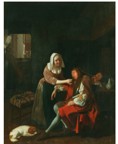
Fig 2. Jacob Ochtervelt, The Sleeping Soldier , ca. 1660–63, oil on panel, 46 x 37.7 cm, Manchester City Art Gallery (Assheton Bennett Collection), inv. 1979.483