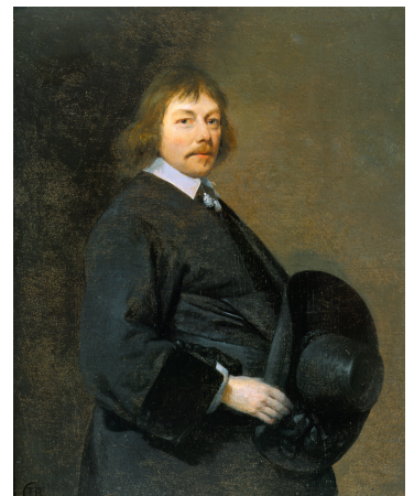
Fig 2. Gerard ter Borch, Portrait of a Man , ca. 1652–53, oil on panel, 28 x 23 cm, private collection