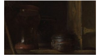
Fig 5. Detail of shelf with glass and metal jars, Gerrit Dou, Scholar Interrupted at His Writing , GD-102

Three known much later versions and an engraving from around 1760 by Nicolas Joseph Voyez ( fig 6 ) correspond compositionally to the Scholar Interrupted , yet the painted versions may have been modeled after another now lost variant. They all differ from the present work in their arched-top rather than oval format, and only the Voyez print includes the scarf draped over the table edge and reflects the precise position of the pen case on the table as it appears in Scholar Interrupted . [15] The lightly colored ground of the present work, visible along the entire circumference of the panel's edge, rules out any possibility that the format was modified.