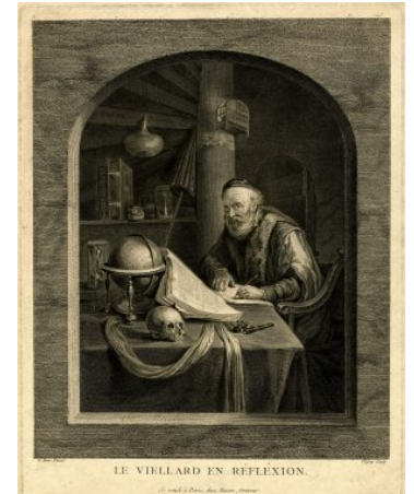
Fig 6. Nicolas Joseph Voyez (1742–1806), after Gerrit Dou, Le vieillard en réflexion , ca. 1757–73, engraving, 355 x 275 mm, British Museum, London, © Trustees of the British Museum