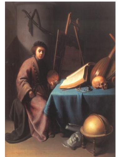
Fig 3. Attributed to Gerrit Dou, Artist in His Studio , ca. 1630–32, oil on panel, 59 x 43.5 inches, private collection, United Kingdom