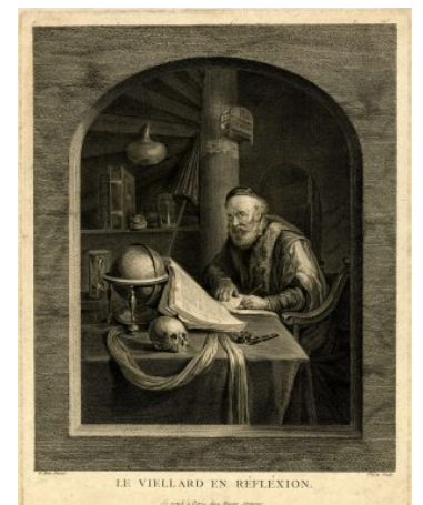
Fig 6. Nicolas Joseph Voyez (1742–1806), after Gerrit Dou, Le vieillard en réflexion , ca. 1757–73, engraving, 355 x 275 mm, British Museum, London, © Trustees of the British Museum