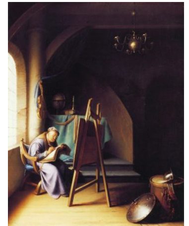
Fig 4. Gerrit Dou, Man Writing by an Easel , ca. 1631–32, oil on panel, 31.5 x 25 inches, private collection

in His Studio , ca. 1630–32, oil on panel, 59 x 43.5 inches, private collection, United Kingdom