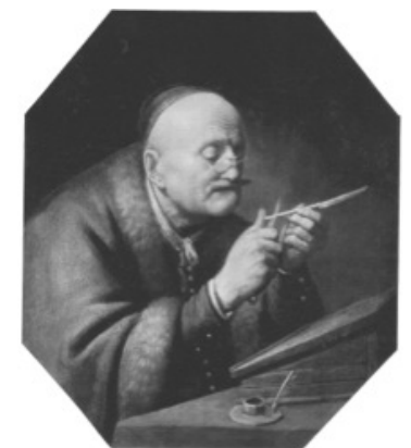
Fig 2. Gerrit Dou, Scholar Sharpening His Quill , ca. 1632, oil on panel, octagonal, 21 x 18 cm, whereabouts unknown