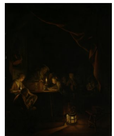
Fig 3. Willem Joseph Laquy after Gerrit Dou, The Night School , ca. 1770, oil on canvas, 83 x 70 cm, Rijksmuseum, Amsterdam, SK-A-2320-B