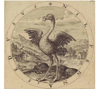
Fig 1. Crispijn van de Passe, "Nil penna sed usus," engraving from Gabriel Rollenhagen, Emblemata ofte Volsinnighe uytbeelses versamelt ende vermeerderd met syne eygene sinrijcke vindingen (Arnhem and Utrecht, 1617)