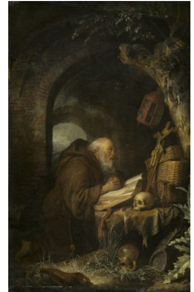
Fig 2. Gerrit Dou, The Hermit , 1670, oil on oak panel, 46 x 34.5 cm, National Gallery of Art, Washington D.C., Timken Collection, 1960.6.8

Old Man Praying once formed part of the distinguished collection of Lothar Franz von Schönborn (1655–1729), Elector of Mainz and Archbishop of Bamberg at Pommersfelden, one of the most important collections of paintings in eighteenth-century Germany. By the time Schönborn acquired this painting in 1719, he had amassed a collection of almost one thousand works of art, eventually owning nine paintings by Dou. [8] In 2006 the present owner acquired this small masterpiece along with another soulful image of an elderly person, Rembrandt's Study of a Woman in a White Cap (RR-101), at the same Sotheby's sale in New York. [9]