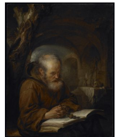
Fig 1. Gerrit Dou, Hermit Praying , 1670, oil on panel, 33.6 x 27 cm, The Minneapolis Institute of Arts, Minneapolis, The William Hood Dunwoody Fund, inv. 87.11