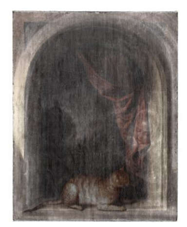
Fig 3. X-radiograph of Cat Crouching on the Ledge of an Artist's Atelier , GD-108, with X-ray superimposed in registration with the visual image