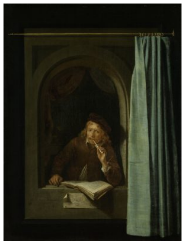
Fig 11. Gerrit Dou, Painter with Pipe and Book , ca. 1645, oil on panel, 48 x 37 cm, Rijksmuseum, Amsterdam, SK-A-86