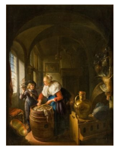
Fig 12. Gerrit Dou, The Mousetrap , ca. 1650, oil on panel, 47 x 36 cm, Musée Fabre, Montpellier, © Musée Fabre — Montpellier Agglomération / cliché F. Jaulmes