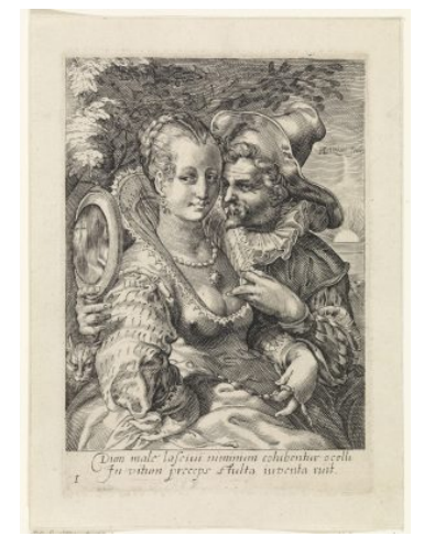
Fig 9. Jan Saenredam, after Hendrick Goltzius, Sight, ca. 1595–96, engraving, 177 x 124 mm, Rijksprentenkabinet, Rijksmuseum, Amsterdam, RP-P-1884-A-7717