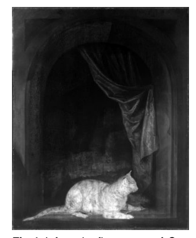
Fig 4. Infrared reflectogram of Cat Crouching on the Ledge of an Artist's Atelier , GD-108