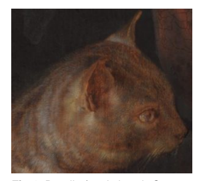
Fig 1. Detail of cat's head, Cat Crouching on the Ledge of an Artist's Atelier, GD-108