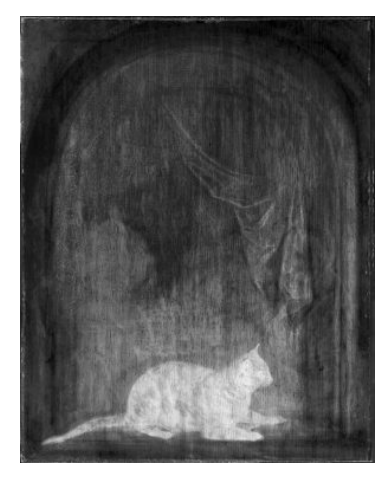
Fig 7. Infrared photograph superimposed on X-radiograph with inverted density grayscale of Cat Crouching on the Ledge of an Artist'

Atelier, GD-108