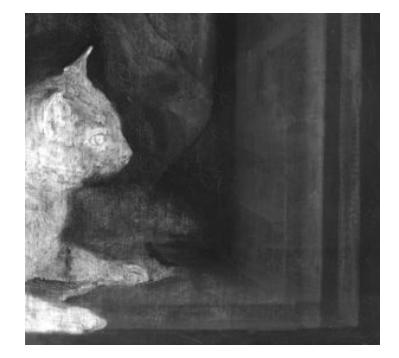
Fig 5. Detail of infrared reflectogram of Cat Crouching on the Ledge of an Artist's Atelier , GD-108, showing silhouette of what appears to be a mousetrap in the lower right corner

The question remains as to why Dou turned his iconographic focus from a figural group involving a cat, a mousetrap, and young woman to a simplified scene of a cat alone within an architectural niche. The iconography of the cat and mousetrap was relatively novel in genre painting in the 1650s, and with his initial layout of the composition, Dou may have intended to explore the