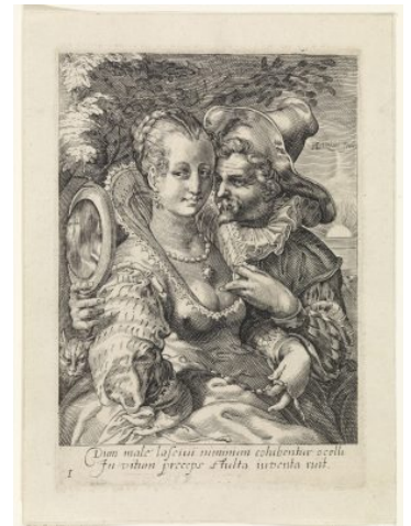
Fig 9. Jan Saenredam, after Hendrick Goltzius, Sight , ca. 1595–96, engraving, 177 x 124 mm, Rijksprentenkabinet, Rijksmuseum, Amsterdam, RP-P-1884-A-7717