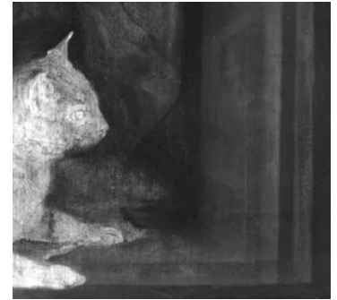
Fig 5. Detail of infrared reflectogram of Cat Crouching on the Ledge of an Artist's Atelier , GD-108, showing silhouette of what appears to be a mousetrap in the lower right corner

The present work is one of three known paintings by Dou featuring animals. [21] King Augustus II acquired Cat Crouching on the Ledge of an Artist's Atelier in the early eighteenth century for the imperial house collections of the Royal Palace in Dresden, where it remained, with nineteen other autograph paintings by Dou, until the third decade of the twentieth century. [22] In the 1920s the Gemäldegalerie in Dresden de-