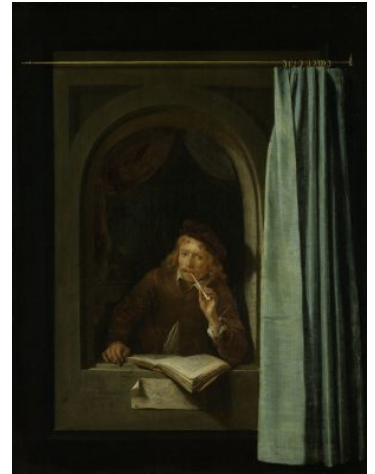
Fig 11. Gerrit Dou, Painter with Pipe and Book , ca. 1645, oil on panel, 48 x 37 cm, Rijksmuseum, Amsterdam, SK-A-86