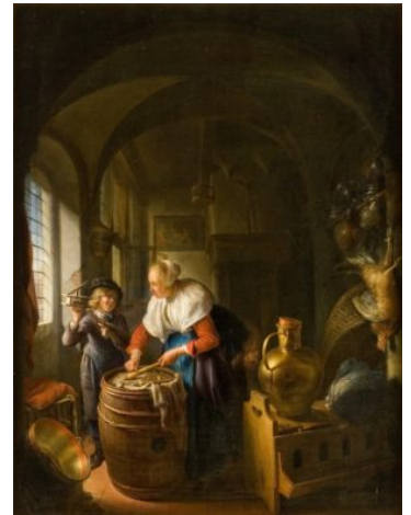
Fig 12. Gerrit Dou, The Mousetrap , ca. 1650, oil on panel, 47 x 36 cm, Musée Fabre, Montpellier, © Musée Fabre — Montpellier Agglomération / cliché F. Jaulmes