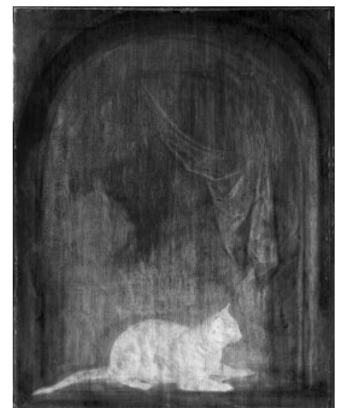
Fig 7. Infrared photograph superimposed on X-radiograph with inverted density grayscale of Cat Crouching on the Ledge of an Artist's Atelier , GD-108