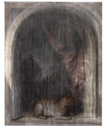
Fig 3. X-radiograph of Cat Crouching on the Ledge of an Artist's Atelier , GD-108, with X-ray superimposed in registration with the visual image