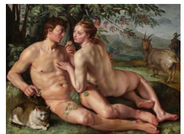
Fig 10. Hendrick Goltzius, Fall of Man , 1616, oil on canvas, 104.5 x 138.4 cm, National Gallery of Art, Washington D.C., Patrons' Permanent Fund, 1996.34.1