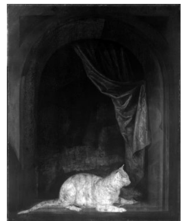
Fig 4. Infrared reflectogram of Cat Crouching on the Ledge of an Artist's Atelier , GD-108