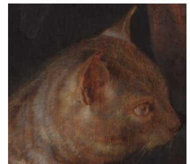
Fig 1. Detail of cat's head, Cat Crouching on the Ledge of an Artist's Atelier , GD-108

In this striking painting Dou portrayed a grey-and-white-striped cat crouching in profile on a stone niche opening into an artist's studio, a subject that is unique in the artist's oeuvre. [2] The cat's individualized character and the specificity of the portrayal suggest that it was modeled after a particular animal. [3] Using a brush consisting of