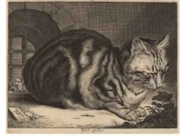
Fig 8. Cornelis Visscher, The Large Cat , ca. 1657, engraving on laid paper, 22.1 x 31.5 cm, National Gallery of Art, Washington D.C., Ailsa Mellon Bruce Fund, 1995.72.1