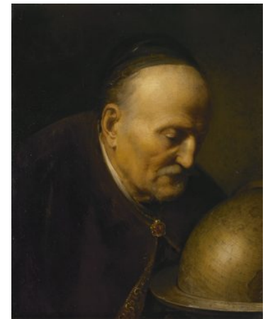
Fig 1. Gerrit Dou, Astronomer (Heraclitus?) , ca. 1628, oil on panel, 38.5 x 31 cm, State Hermitage Museum, St. Petersburg, inv. 1012