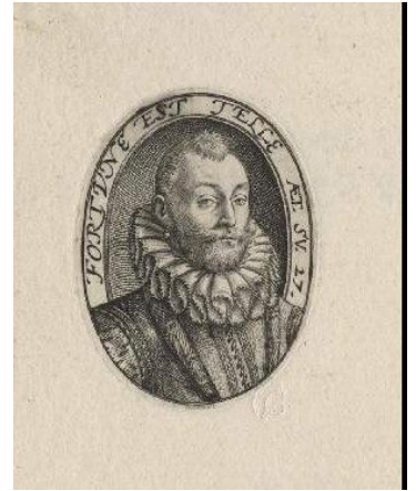
Fig 6. Hendrick Goltzius, Jan van Heussen at the Age of 27 , ca. 1581, engraving, 4.8 x 3.5 cm, Fitzwilliam Museum, Cambridge, inv. P.7330-R, Hollstein (English) H 196