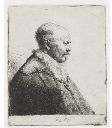
Fig 3. Rembrandt van Rijn, Bust of an Old man , 1630, etching, 11.8 x 9.7 cm, Rijksprentenkabinet RP-P-OB-590