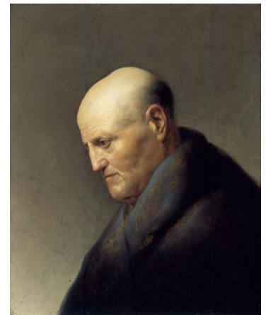
Fig 4. Jan Lievens, Head of an Old Man , ca. 1629, oil on panel, 59.7 x 48 cm. unframed, National Gallery of Ireland Collection, Photo © National Gallery of Ireland