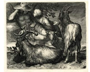
Fig 4. Boetius Bolswert after Abraham Bloemaert, Pastoral Couple with Goats, 1611, engraving, 113 x 135 mm, The British Museum, London, inv. D.7.151AN457100001