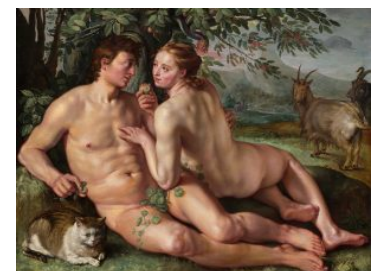
Fig 5. Hendrick Goltzius, Fall of Man , 1616, oil on canvas, 104.5 x 138.4 cm, National Gallery of Art, Washington D.C., Patrons' Permanent Fund, 1996.34.1