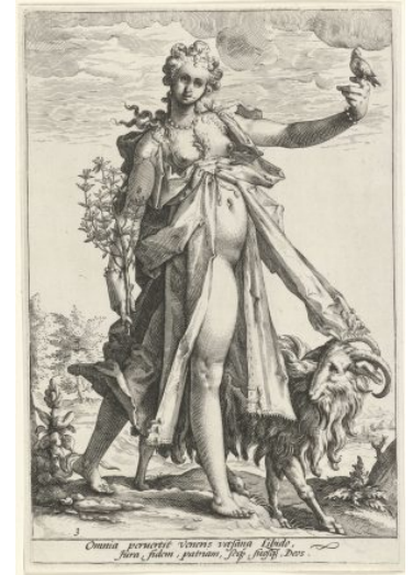
Fig 7. Jacob Matham after Hendrick Goltzius, Libido ( Luxuria ), 1585–89, engraving, 216 x 144 mm, Rijksprentenkabinet, Rijksmuseum, Amsterdam, inv. RP-P-OB-27.227