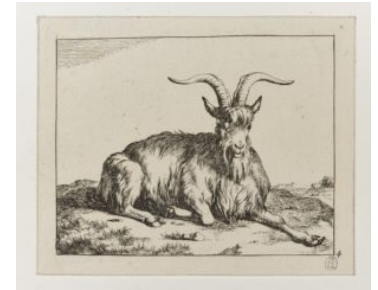
Fig 3. Marcus de Bijle after Paulus Potter, Recumbent Goat, 1654–88, engraving, 117 x 147 mm, Museum Boijmans van Beuningen, Rotterdam, inv. BdH 1138 (PK)