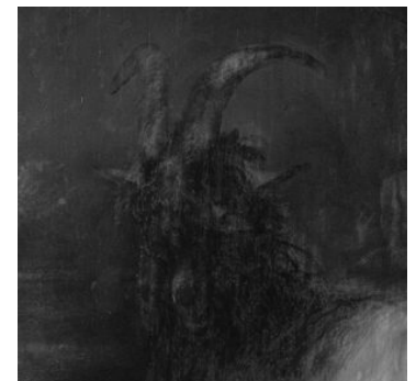
Fig 1. Detail of infrared photograph of GD-114, showing the changes made around the position of the goat's head