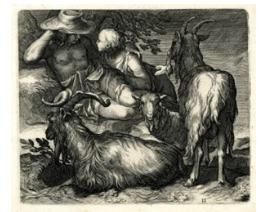
Fig 4. Boetius Bolswert after Abraham Bloemaert, Pastoral Couple with Goats, 1611, engraving, 113 x 135 mm, The British Museum, London, inv. D.7.151AN457100001