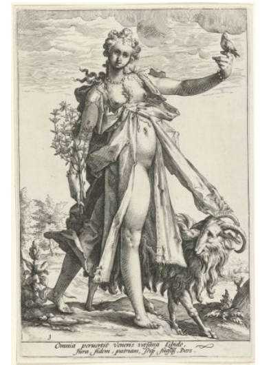
Fig 7. Jacob Matham after Hendrick Goltzius, Libido (Luxuria) , 1585–89, engraving, 216 x 144 mm, Rijksprentenkabinet, Rijksmuseum, Amsterdam, inv. RP-P-OB-27.227