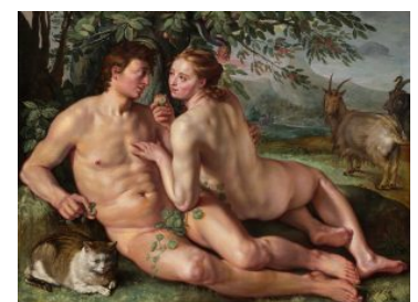
Fig 5. Hendrick Goltzius, Fall of Man , 1616, oil on canvas, 104.5 x 138.4 cm, National Gallery of Art, Washington D.C., Patrons' Permanent Fund, 1996.34.1