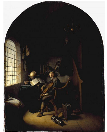
Fig 1. Gerrit Dou, An Interior with Young Violinist , 1637, oil on panel, arched top, 31.1 x 23.7 inches, National Gallery of Scotland, Edinburgh, NG 2420