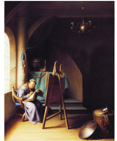
Fig 4. Gerrit Dou, Man Writing by an Easel , ca. 1631–32, oil on panel, 31.5 x 25 inches, private collection

oil on panel, 59 x 43.5 inches, private collection, United Kingdom