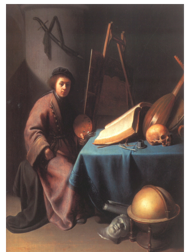
Fig 3. Attributed to Gerrit Dou, Artist in His Studio , ca. 1630-32,