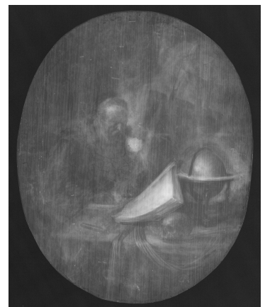
Fig 2. X-radiograph of Gerrit Dou, Scholar Interrupted at His Writing , GD-102