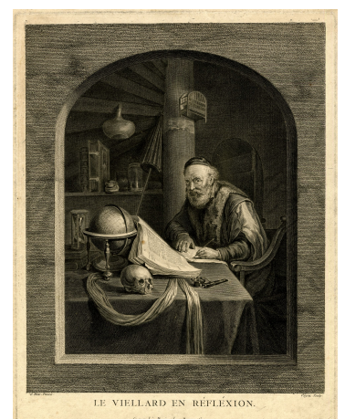
Fig 6. Nicolas Joseph Voyez (1742–1806), after Gerrit Dou, Le vieillard en réflexion , ca. 1757–73, engraving, 355 x 275 mm, British Museum, London, © Trustees of the British Museum