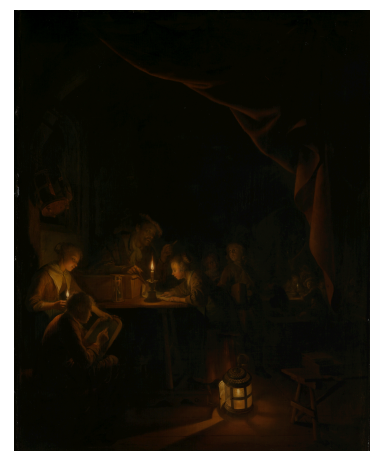
Fig 3. Willem Joseph Laquy after Gerrit Dou, The Night School , ca. 1770, oil on canvas, 83 x 70 cm, Rijksmuseum, Amsterdam, SK-A-2320-B