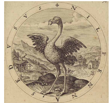
Fig 1. Crispijn van de Passe, "Nil penna sed usus," engraving from Gabriel Rollenhagen, Emblemata ofte Volsinnighe uytbeelses versamelt ende vermeerderd met syne eygene sinrijcke vindingen (Arnhem and Utrecht, 1617)