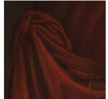
Fig 1. Detail of drapery showing hatching, Young Woman in a Niche with a Parrot and Cage , GD-105