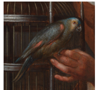
Fig 3. Detail of blue-fronted Amazon parrot, Young Woman in a Niche with a Parrot and Cage , GD-105