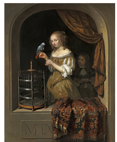
Fig 6. Caspar Netscher, Woman Feeding a Parrot, with a Page , signed and dated, lower left, C Netscher. Ao. / 16.66, oil on panel, 46 x 37 cm, National Gallery of Art, Washington D.C., The Lee and Juliet Folger Fund