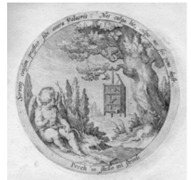
Fig 5. Daniel Heinsius, Emblemata amatoria (Amsterdam, 1608), no. 21: "Perch'io stesso mi strinsi" (For I have bound myself)