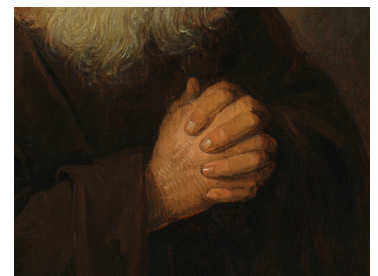
Fig 2. Detail of Gerrit Dou, Old Man Praying , ca. 1665–70, oil on panel, 17.8 x 12.7 cm, GD-107