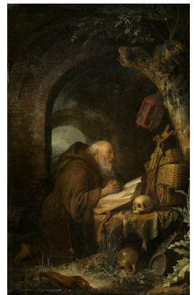
Fig 2. Gerrit Dou, The Hermit , 1670, oil on oak panel, 46 x 34.5 cm, National Gallery of Art, Washington D.C., Timken Collection, 1960.6.8