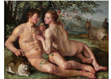
Fig 5. Hendrick Goltzius, Fall of Man , 1616, oil on canvas, 104.5 x 138.4 cm, National Gallery of Art, Washington D.C., Patrons' Permanent Fund, 1996.34.1

Couple with Goats, 1611, engraving, 113 x 135 mm, The British Museum, London, inv. D,7.151AN457100001