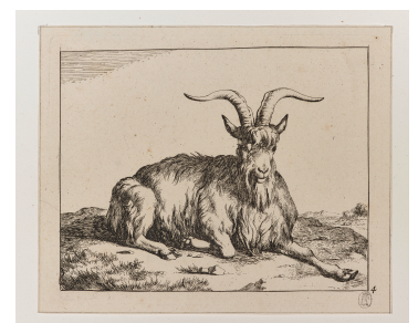
Fig 3. Marcus de Bije after Paulus Potter, Recumbent Goat, 1654–88, engraving, 117 x 147 mm, Museum Boijmans van Beuningen, Rotterdam, inv. BdH 1138 (PK)