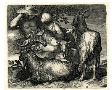
Fig 4. Boetius Bolswert after Abraham Bloemaert, Pastoral Couple with Goats