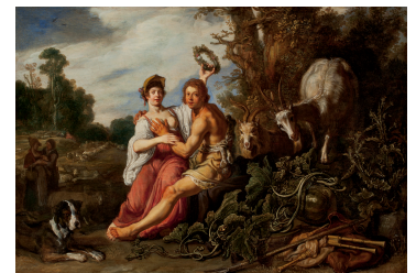
Fig 6. Pieter Lastman, Paris and Oenone , 1619, oil on panel, 48.9 x 71.4 cm, Worcester Art Museum, Gift of Mr. and Mrs. John Adam, inv. no. 1984.39. Image © Worcester Art Museum, all rights reserved