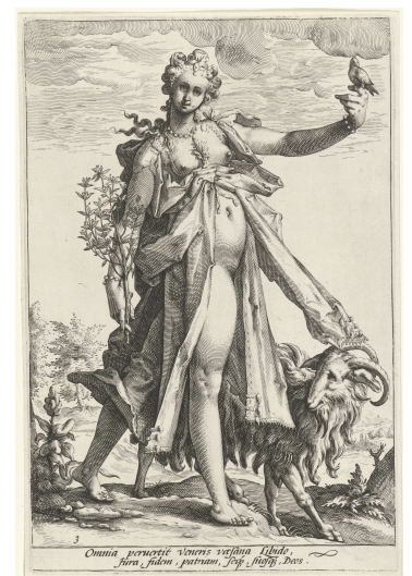
Fig 7. Jacob Matham after Hendrick Goltzius, Libido ( Luxuria ), 1585–89, engraving, 216 x 144 mm, Rijksprentenkabinet, Rijksmuseum, Amsterdam, inv.