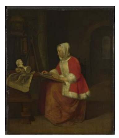
Fig 4. Gabriel Metsu, A Woman Drawing, 1657–59, oil on panel, 36.3 x 30.7 cm, Presented by the 1st Viscount Rothermere, 1940, The National Gallery, London, NG 5225, © National Gallery, London / Art Resource, NY