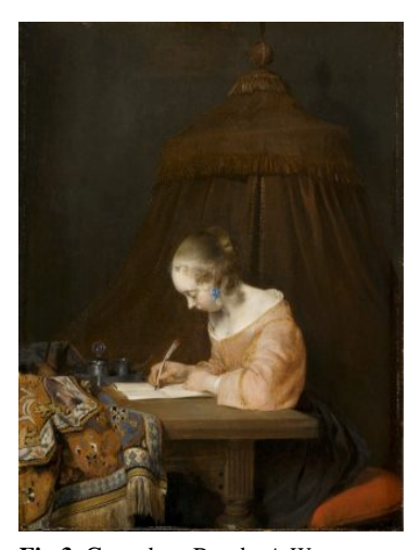
Fig 3. Gerard ter Borch, A Woman Writing a Letter , ca. 1655–56, oil on