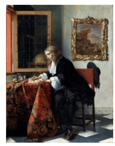
Fig 1. Gabriel Metsu, Man Writing a Letter , ca. 1664–66, oil on panel, 52.5 x 40.2 cm, National Gallery of Ireland, NGI.4536