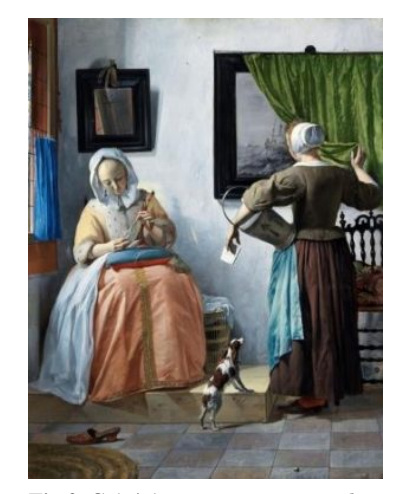
Fig 2. Gabriel Metsu, Woman Reading a Letter , ca. 1664–66, oil on panel, 52.5 x 40.2 cm, National Gallery of Ireland. NGI.4537