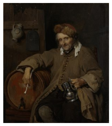
Fig 2. Gabriel Metsu, An Old Man Holding a Pipe and a Jug , 1661–63, oil on panel, 22 x 19.5 cm, Rijksmuseum, Amsterdam, SK-A-250