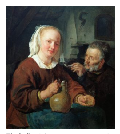
Fig 3. Gabriel Metsu, A Woman with a Jug and a Man with a Pipe , 1654–57, oil on canvas, 33 x 29.2 cm, Cheltenham Art Gallery and Museum, Cheltenham, Baron de Ferrières