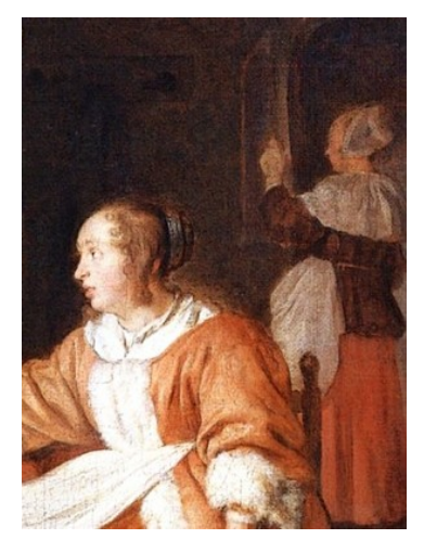
Fig 1. Detail of Gabriel Metsu, A Woman Offering a Glass of Wine to a Man , 1658–60, oil on canvas, 40.6 x 35.5 cm, private collection