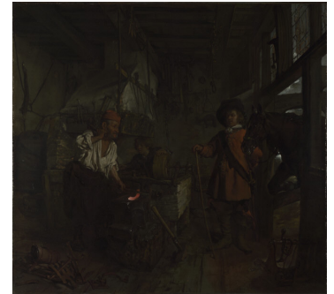
Fig 4. Gabriel Metsu, A Cavalier Visiting a Blacksmith Shop , 1654–56, oil on canvas, 65.4 x 73.3 cm, Salting Bequest, 1910, The National Gallery, London, NG 2591, © National Gallery, London / Art Resource, NY

on panel, 50 x 38.8 cm, Hamburger Kunsthalle, Hamburg, 378, bpk, Berlin / Hamburger Kunsthalle / Elke Walford / Art Resource, NY