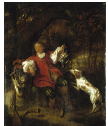
Fig 3. Gabriel Metsu, A Hunter Showing His Prey , 1654–56, oil