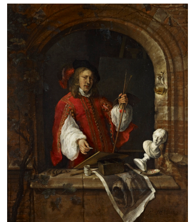
Fig 2. Gabriel Metsu, Self-Portrait as a Painter , 1655–58, oil on panel, 38 x 31.4 cm, Royal Collection, Her Majesty Queen Elizabeth II, 901