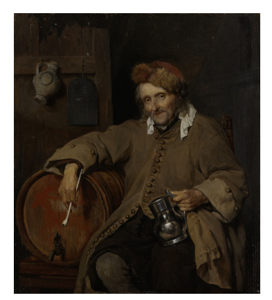
Fig 2. Gabriel Metsu, An Old Man Holding a Pipe and a Jug , 1661–63, oil on panel, 22 x 19.5 cm, Rijksmuseum, Amsterdam, SK-A-250