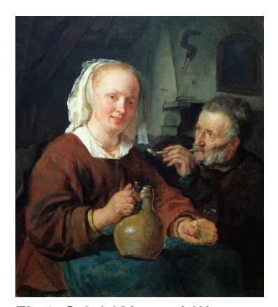
Fig 3. Gabriel Metsu, A Woman with a Jug and a Man with a Pipe , 1654–57, oil on canvas, 33 x 29.2 cm, Cheltenham Art Gallery and Museum, Cheltenham, Baron de Ferrières