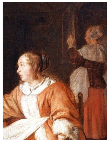
Fig 1. Detail of Gabriel Metsu, A Woman Offering a Glass of Wine to a Man , 1658–60, oil on canvas, 40.6 x 35.5 cm, private collection