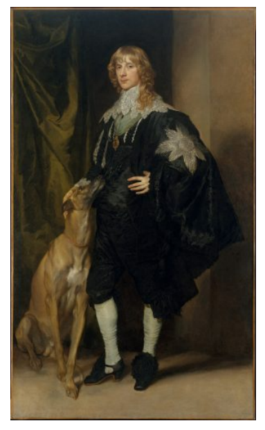
Fig 1. Anthony van Dyck, James Stuart, Duke of Richmond and Lennox , ca. 1633–35, oil on canvas, 215.9 x 127.6 cm, New York, Metropolitan Museum of Art, Marquand Collection, Gift of Henry G. Marquand, 1889, 89.15.16