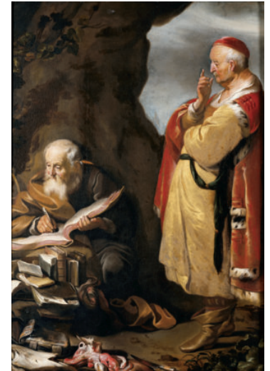
Fig 3. Jacob Adriaensz Backer, Hippocrates Visits Democritus in Abdera , ca. 1633, oil on canvas, 94 x 64 cm, Bader Collection, Milwaukee.

100 x 90 cm, Musée des Beaux-Arts, Rouen, inv. no. 1809.2, © C. Lancien, C. Loisel / Réunion des Musées Métropolitains Rouen Normandie.