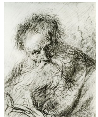
Fig 3. Jan Lievens, A Bearded Old Man with a Book , ca. 1626-27, chalk drawing, 166 x 134 mm, Hessisches Landesmuseum, Darmstadt, inv. no. AE 672