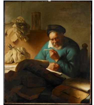
Fig 1. Jan Lievens, The Pen Cutter , ca. 1627, oil on canvas, 127 x 107.5 cm, Wallraf-Richartz-Museum & Fondation Corboud, on permanent loan from Sal. Oppenheim Collection, Inv.nr. WRM Dep. 943