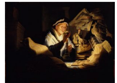
Fig 2. Rembrandt van Rijn, The Goldweigher , 1627, oil on panel, 31.9 x 42.5 cm, Staatliche Museen zu Berlin, Gemäldegalerie, inv. no. 828D