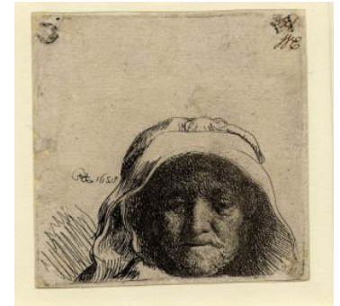
Fig 1. Rembrandt van Rijn, Rembrandt's Mother, 1628, etching, 64 x 64 mm, British Museum, London, F.6.122, 1843.0607.219