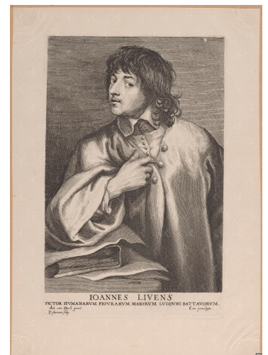
Fig 2. Lucas Vorsterman after Sir Anthony van Dyck, Portrait of Jan Lievens , ca. 1632, engraving on laid paper, 24.4 x 15.6 cm, National Gallery of Art, Washington D.C., 1990.125.1.59