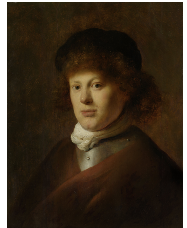
Fig 1. Jan Lievens, Portrait of Rembrandt van Rijn , ca. 1628, oil on panel, 57 x 44.7 cm, Rijksmuseum, Amsterdam, on loan from a private collector, SK-C-1598