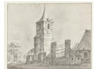
Fig 2. Circle of Jan Beerstraeten, The Church of Warmond , ca. 1660, black chalk, gray wash, 175 x 225 mm, Rijksmuseum, Amsterdam, RP-T-1879-A-22