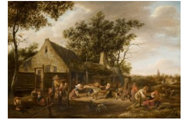
Fig 1. Jan Steen, Peasants Dancing before an Inn , ca. 1647, panel, 38.5 x 56.5 cm, Mauritshuis, The Hague, inv. 553