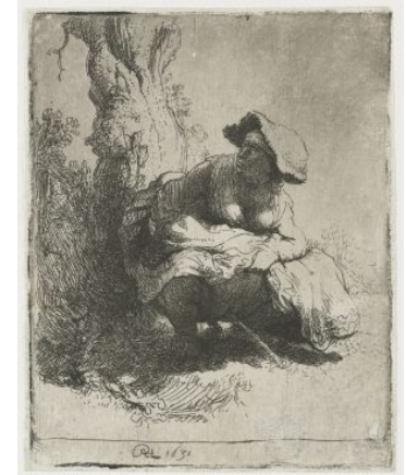
Fig 4. Rembrandt van Rijn, Woman Urinating , 1631, etching, 81 x 64 mm, Rijksmuseum, Amsterdam, RP-P-OB-637

In numerous Dutch paintings and prints, town-dwellers are shown observing merrymaking peasants. “Aensiet dit boersche volk” (Look at these peasant folk) are the first words of the caption to an engraving by Willem van Swanenburgh after David Vinckboons. This motif also appears elsewhere in Steen’s work, as in Village Fair of the early 1650s and Winter Landscape in Skokloster. [10] Here, it seems likely that Steen simply wanted to present an array of people from different walks of life rather than highlighting the